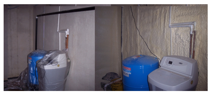
Before & after pictures of closed cell foam sprayed directly on a basement wall

Flash & Batt – Economical Air Sealing. 2 lb. Closed Cell Foam is sprayed ¼" to ½" thick to seal stud cavity and any cracks or penetrations in walls. We then install Fiberglass Batts. This takes advantage of the air sealing properties of spray foam and the lower cost of the fiberglass insulation.