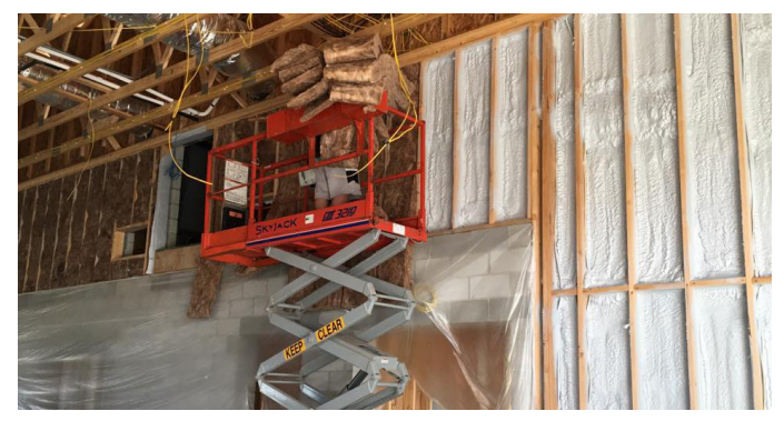
Flash & Batt being performed at the St. Henry EMS Building

R-1 ½ TO R-3 @ ¼ - ½" FOR THE FOAM FOLLOWED BY R-13 OR R-19 FIBERGLASS.